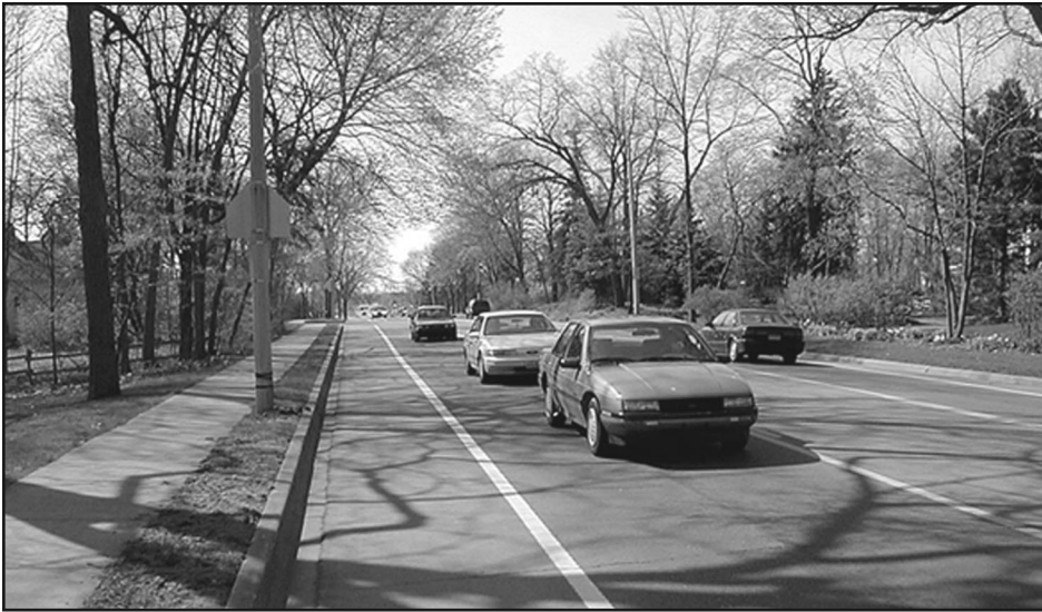
Grand River Boulevard in East Lansing, Michigan, was reduced from four to three lanes.